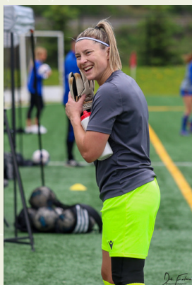
[Click here for photo download]