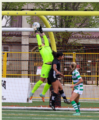
[Click here for photo download]